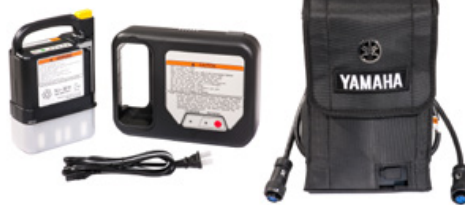
Battery, Backpack and Charger (Nickel or Lithium)